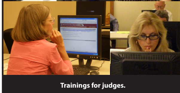
Trainings for judges.